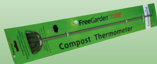
Compost Thermometer $15.00