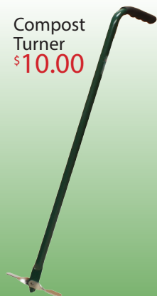
Compost Turner $10.00